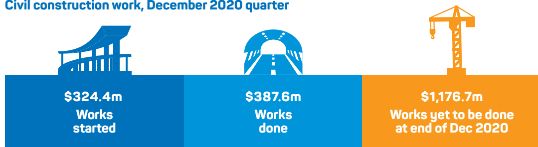
Civil works by activity, December 2020 quarter ($m)